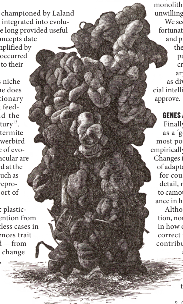
A worm cast pictured in Charles Darwin’s final book.