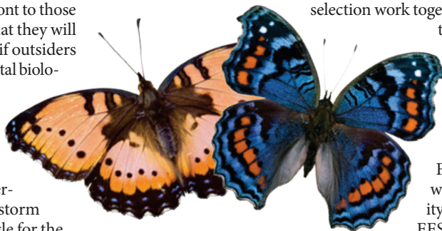
Plasticity: commodore butterflies emerge with different colours in dry (left) and wet seasons.

SET has long regarded inheritance mechanisms outside genes as special cases; human culture being the prime example. The EES explicitly recognizes that parent–offspring similarities result in part from parents reconstructing their own developmental environments for their offspring. ‘Extra-genetic inheritance’ includes PAGE 164 ▶