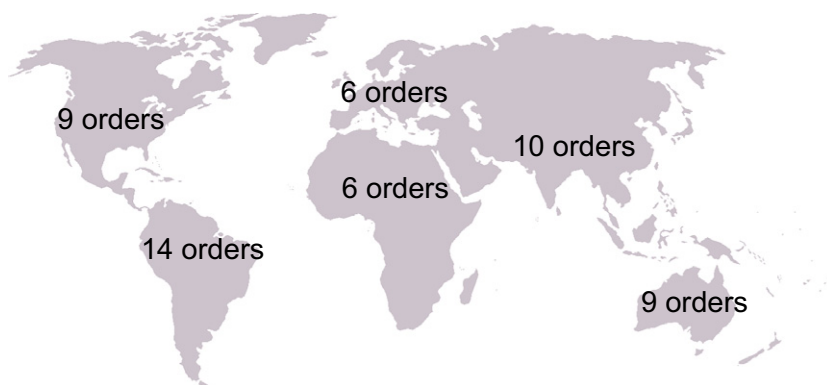
Figure 1 Continental distributions of marine derived freshwater fish lineages, quantified by taxonomic order from Berra (2001). South America harbours the highest diversity of marine derived fish lineages.

Wesselingh & Hoorn (2011) suggested that some MDLs may have originated during Eocene marine incursion events. Evidence from pollen cores indicates Eocene marine incursions occurred in the Andean foreland basin, which today forms the Colombian Llanos and Putumayo, Ecuadorian Oriente, Peruvian Marañon and Ucayali basins (Lundberg et al. , 1998; Santos et al. , 2008). During the Late Eocene, the